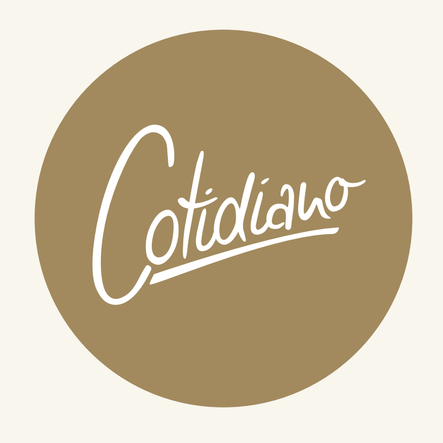
BREAKFAST - BOWLS - BURGER